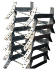
Hot Dip Galvanise